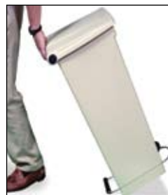
Rear roller on B provides stability and easy transport.