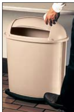
Roll top lid opens easily without the need for overhead clearance.