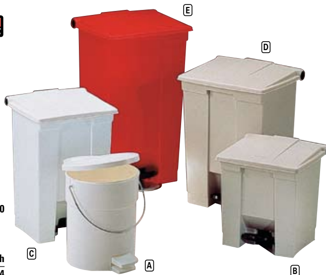
Tight-fitting, overlapping lid has a deodorant block holder.

Slim, oval shape fits easily in tight spaces. Rolltop lid opens without drawing odors into the air, and eliminates the need for overhead clearance. Wraparound foot pedal provides handsfree access from front and sides. Stainless steel lifting rods for long-lasting performance. Beige. 14½-gallon capacity. 14½w x 22¼d x 27¾h. RCP 6177 BEI Each 117.44