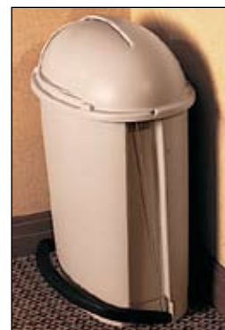
Slim, oval shape fits under counters and out of the way.

Various non-profit organizations such as Factory Mutual (FM), California State Fire Marshal (CSFM) and Underwriters Laboratories (UL) test products for safety compliance. The organizations run various high-temperature and impact tests to determine a product's fire safe or fire resistant listing.